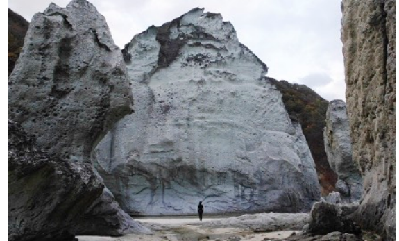
"Spring Water, Fault, Body", 2021 HD Video, 16min. 34sec.