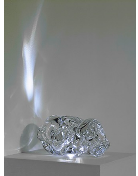
"Fallen Meteorite", 2019, glass, light emitting diode