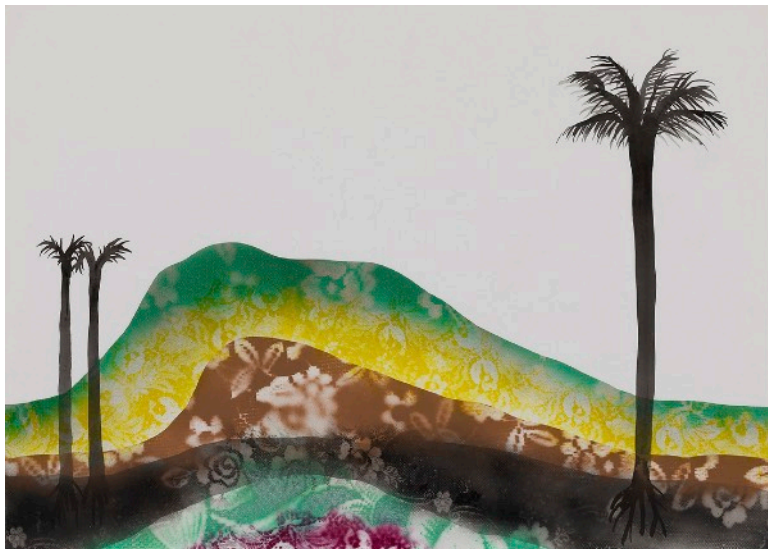
Naho KAWABE "coal beds", 2022, Sumi ink, acrylic spray, watercolor on paper, 496 x 694 mm

The works of both of these artists are based on their own experiences of visiting places far from where they live. Their works, created while looking at things that exist on an immeasurable scale and temporal axis that transcend the human scale of time zones, national borders, and physical distances between two points, prompt viewers to imagine human existence as a type of life on Earth, as well as a temporal axis that almost defies logic and comprehension. We invite you to visit the actual venue to see this exhibition, the result of a dialogue that has accumulated in each of the two artists' respective locations.