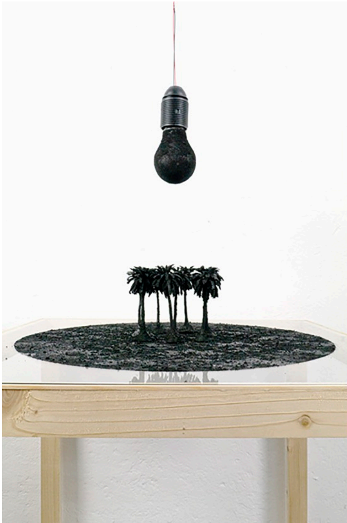
Naho KAWABE "Züchtung (Breeding)", 2020, glass, plastic, charcoal, acrylic, light bulb, dimensions variable

Venue : WAITINGROOM (1F-2-14-2 Suido, Bunkyo-ku, Tokyo 112-0005, JAPAN)