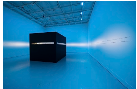
Solo Exhibition "Holiday at War" 12th shiseido art egg (2018) installation view (SHISEIDO GALLERY, Tokyo)