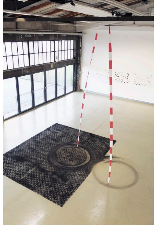
"Social Distances 1,5M" 2022, charcoal, barrier tape, motor, metal, dimensions variable