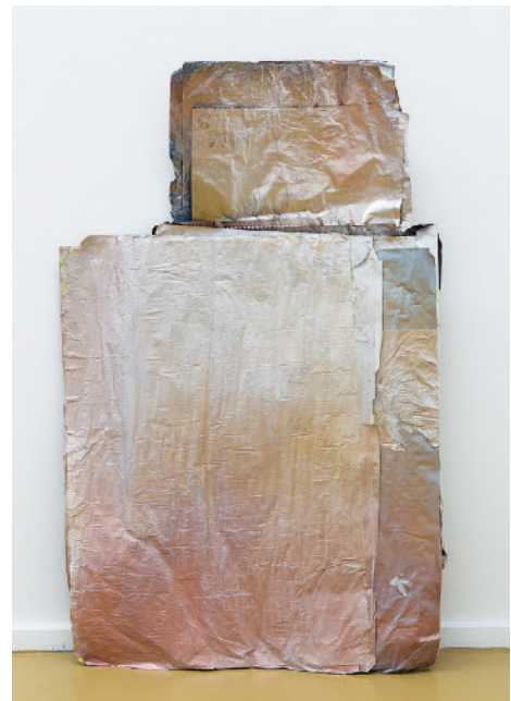
Hanae UTAMURA "Residue: Skin", 2015 Graffiti Spray on fallen poster, 745 x 1170 x 100 mm