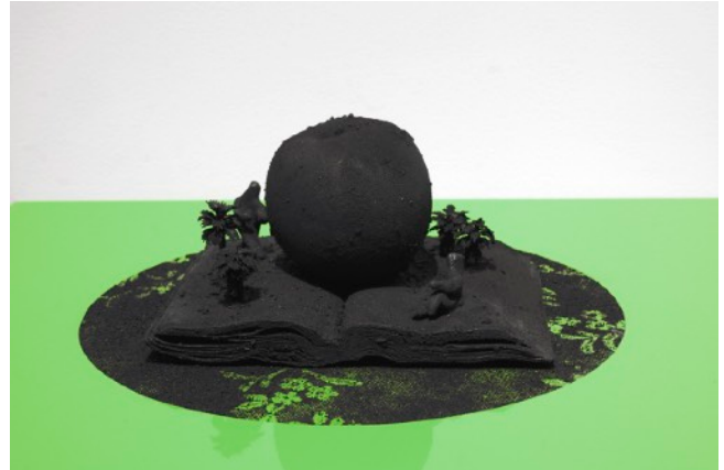
"Black and Green" (detail) 2021, lacquered MDF, plastic, book, charcoal, acrylic, pottery, dimensions variable